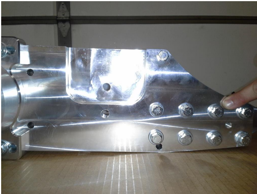
Assembly Picture #2

Cass County Choppers 19420 S Raffurty Road Pleasant Hill, MO 64080