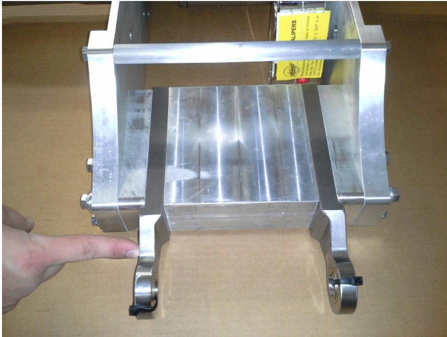
Assembly Picture #1

HARLEY DAVIDSON 2004 & NEWER SPORTSTER TRIKE CONVERSION KIT